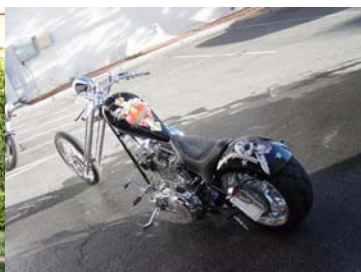
Vince Neil Motorcycle