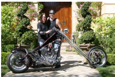
Ozzy Osbourne Motorcycle